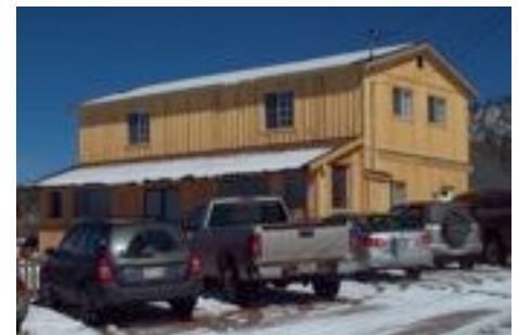
CUSP headquarters in Lake George, CO

Our Energy committee is working on other outreach events for the coming year, so watch for more information at www.tellerenergy.com . If you would like to work on the committee, and help develop the Sustainability Plan please call or email us!